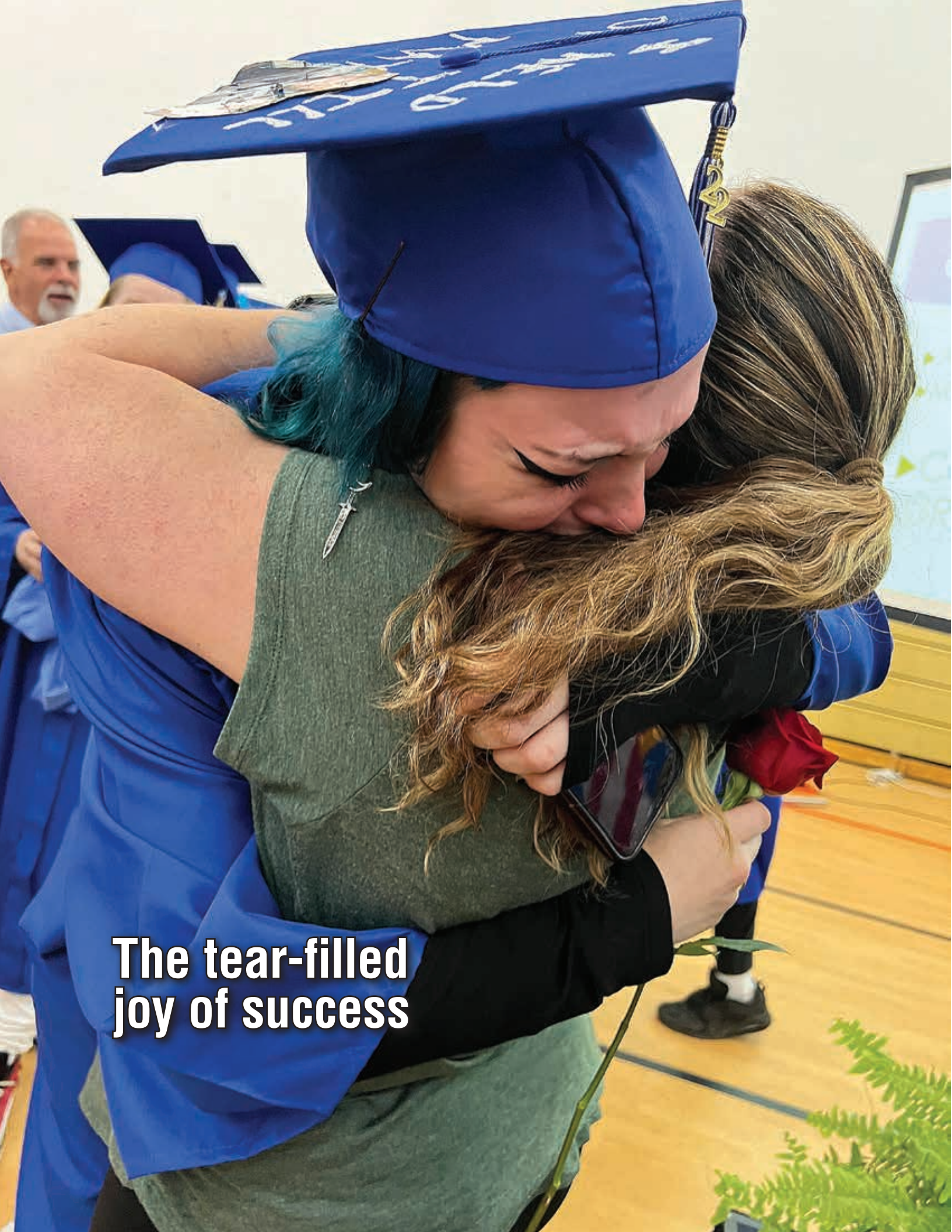
The tear-filled joy of success