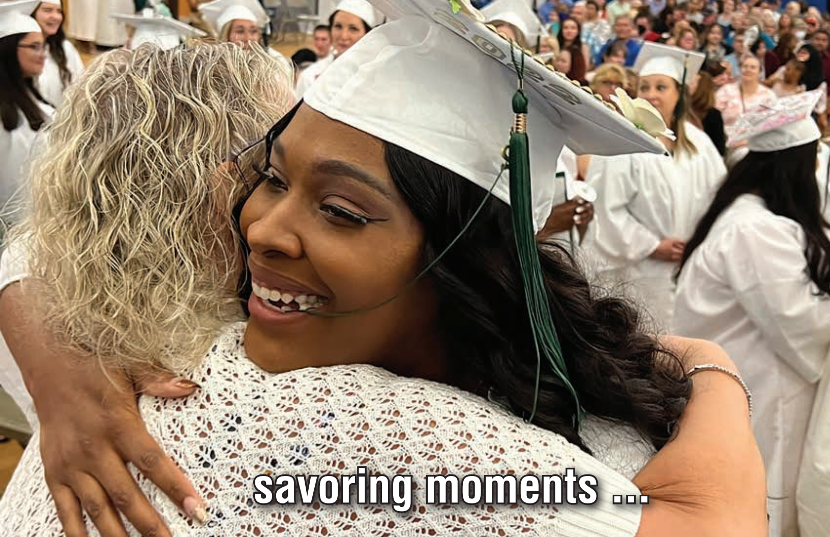
savoring moments ...